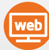
WEB UI 3.0